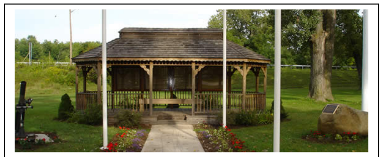
Macedon Veteran's Memorial, Canal Park

Palmyra Macedon Rotary Website: www.palmyramacedonrotary.org Rotary District 7120 Website: www.rotary7120.org Rotary International Website: www.rotary.org