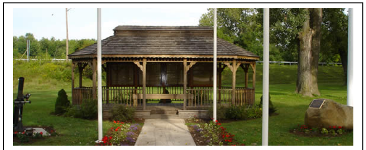
Macedon Veteran's Memorial, Canal Park

Palmyra Macedon Rotary Website: www.palmyramacedonrotary.org Rotary District 7120 Website: www.rotary7120.org Rotary International Website: www.rotary.org