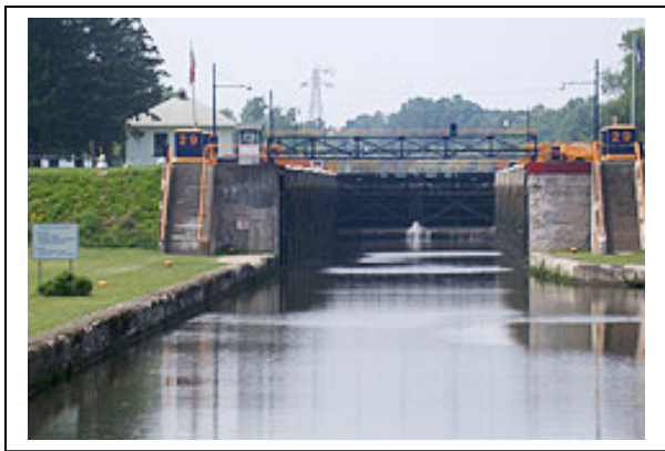
Entering Erie Canal Lock #29 at Palmyra, NY