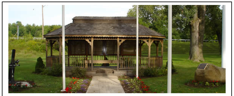
Macedon Veteran's Memorial, Canal Park

Palmyra Macedon Rotary Website: www.palmyramacedonrotary.org Rotary District 7120 Website: www.rotary7120.org Rotary International Website: www.rotary.org