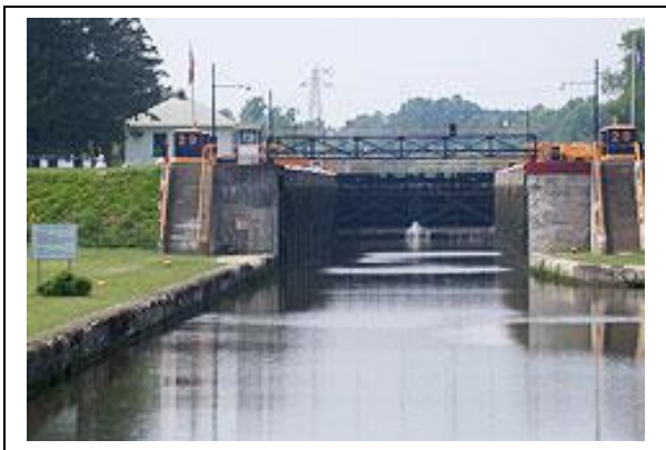
Entering Erie Canal Lock #29 at Palmyra, NY