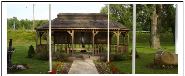
Macedon Veteran's Memorial, Canal Park

Palmyra Macedon Rotary Website: www.palmyramacedonrotary.org Rotary District 7120 Website: www.rotary7120.org Rotary International Website: www.rotary.org